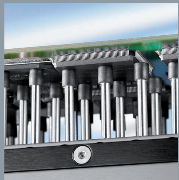
DEK NeoHorizon with Temperature Control Modul (DEK TCM)